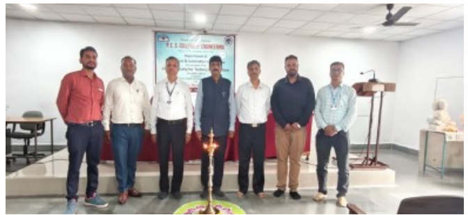
Dignitaries during the inauguration of the SF-FDP.