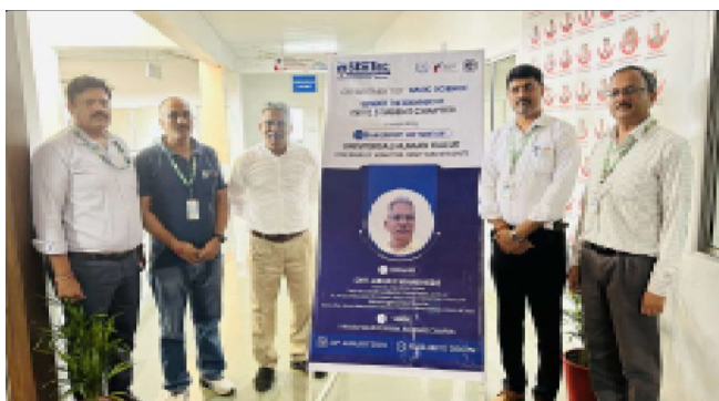
Dignitaries during the programme.