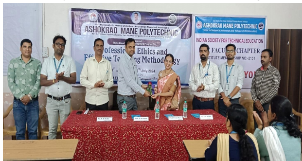
Felicitation to the guest by the dignitaries on the dais.