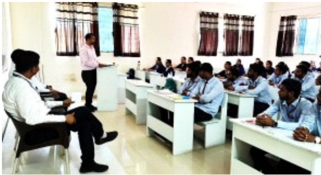
Students during the expert lecture on GIS Surveying & Drone Technology

Another expert lecture on Drone Technology was organised on 23/08/2024. The expert lecture introduced students to two revolutionary tools that have reshaped industries such as urban planning, environmental conservation, agriculture, and infrastructure development. A key focus was the integration of GIS and drones, showcasing how this combination has improved the accuracy and efficiency of real-world projects.