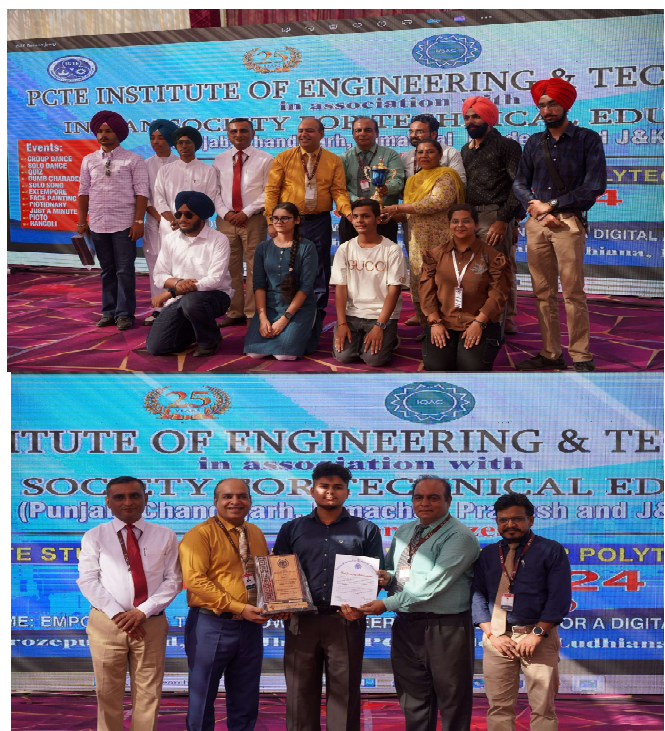
Dignitaries and student participants during the inaugural function.

14 students from different Polytechnic Colleges falling under ISTE Section were awarded the Best Student Award from their respective chapters