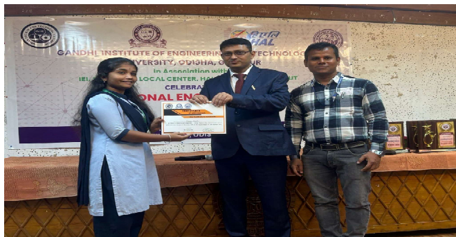
Certificate distribution at a glance.