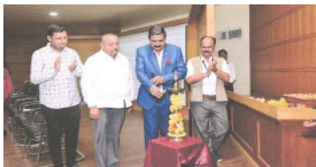
Inauguration of an Induction Program by the Chief Guests.