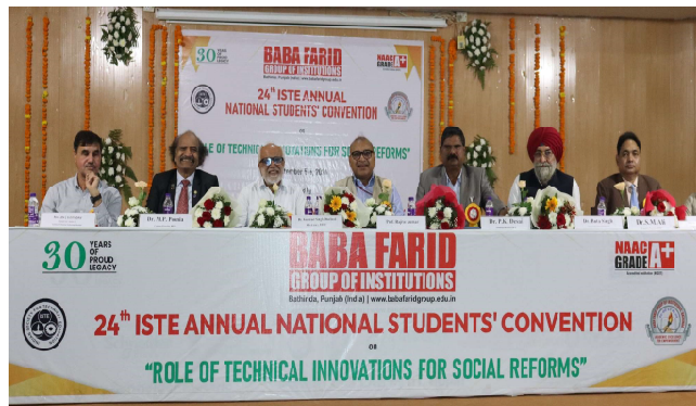
Eminent dignitaries during the inaugural ceremony of 24th ISTE National Student Convention at BFCET, Bathinda

Apart from the competitions and awards, the convention also provided a platform for students to interact with renowned academicians, industry leaders, and innovators. Workshops and interactive sessions were organized, focusing on emerging technologies, entrepreneurship, and the role of engineering in societal transformation. These sessions offered students invaluable insights and motivated them to harness their skills for the greater good.