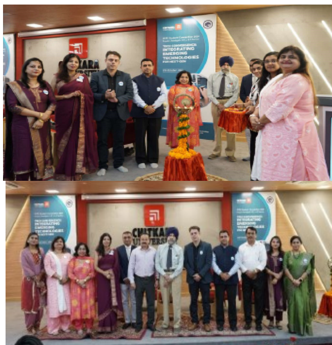
Dignitaries during the inaugural function of the Section Convention.