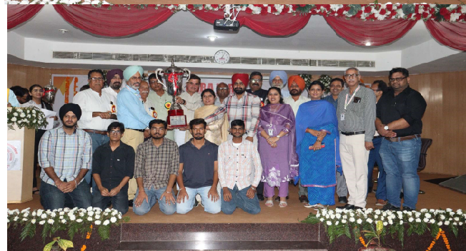
ISTE National Annual Student Convention at glance.